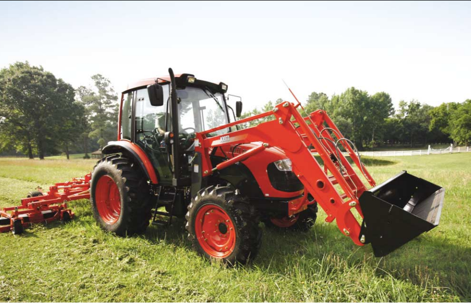
► The implements in the photo are for your reference.

The KL1931 loader is equipped with a universal quick-attach mounting system that makes attaching a bucket as simple as moving a single over-center latch. A built-in parking stand on the front-end loader provides for a quick and easy connection. This loader utilizes the tractor's hydraulic system, features single-lever control with float, and comes with a bucket level indicator.